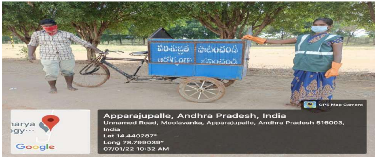
VILLAGE PANCHAYATH VEHICLE COLLECTING WASTE MATERIAL