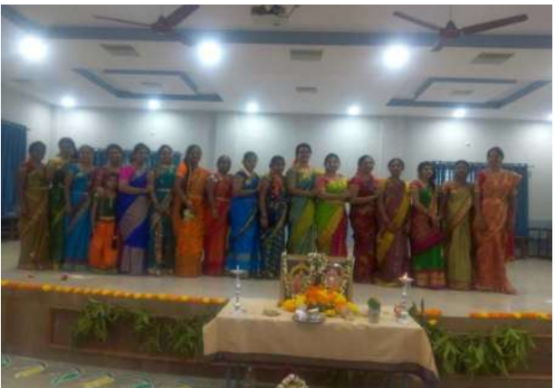
Traditional day celebrations