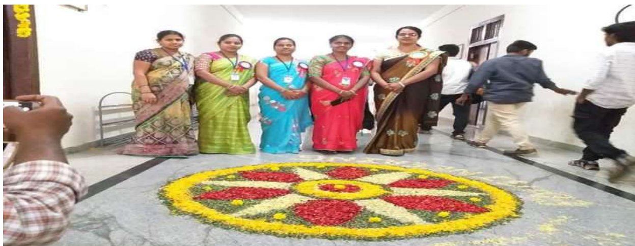
Sankranthi Sambaralu (cultural fest)