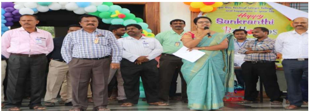
Cultural fest celebrations