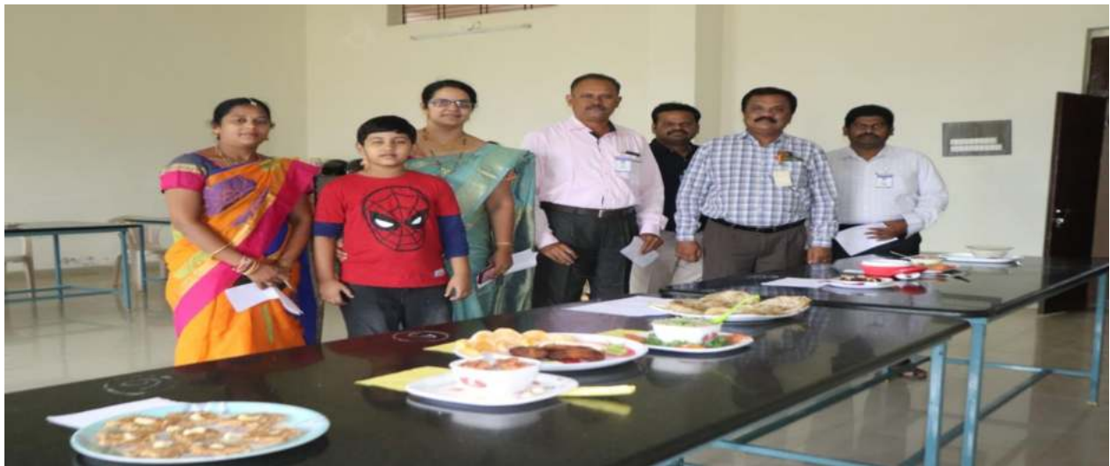
Food festival celebrations