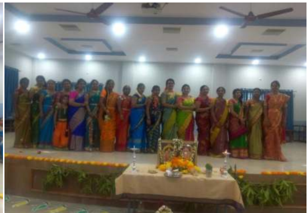
Traditional day celebrations