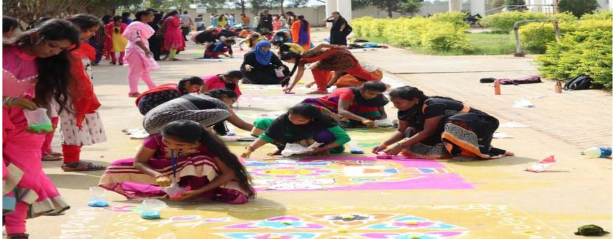
Rangoli (Cultural fest)