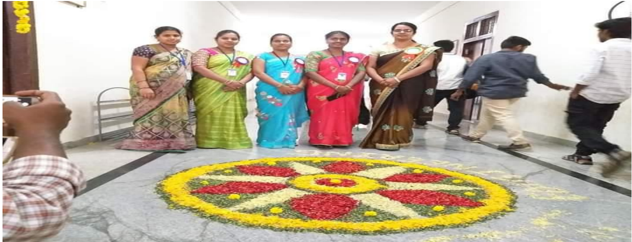
Sankranti Sambaralu (cultural fest)